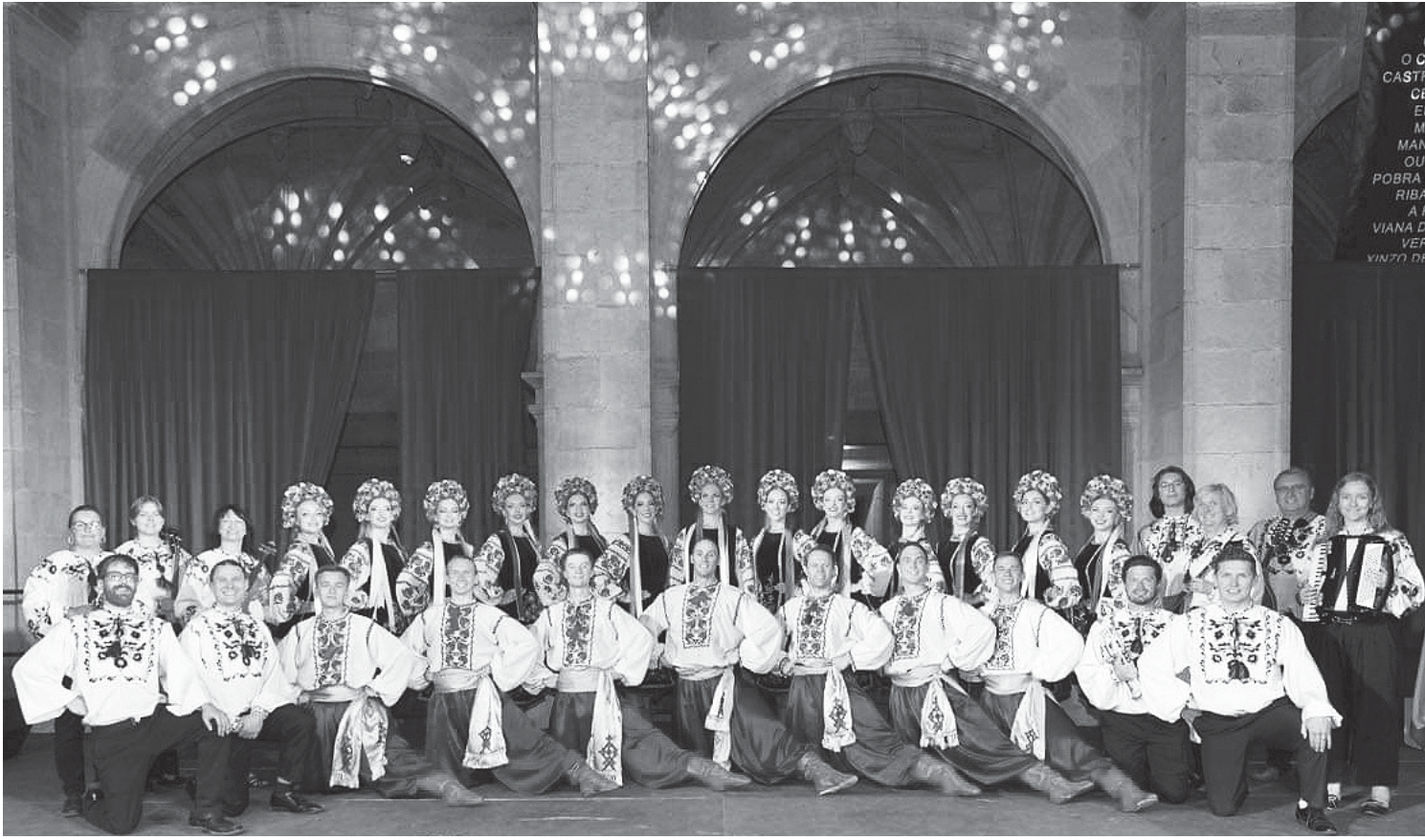
Poltava Ensemble at the Claustro do Mosteiro (Monastery) in Celenova, Spain.